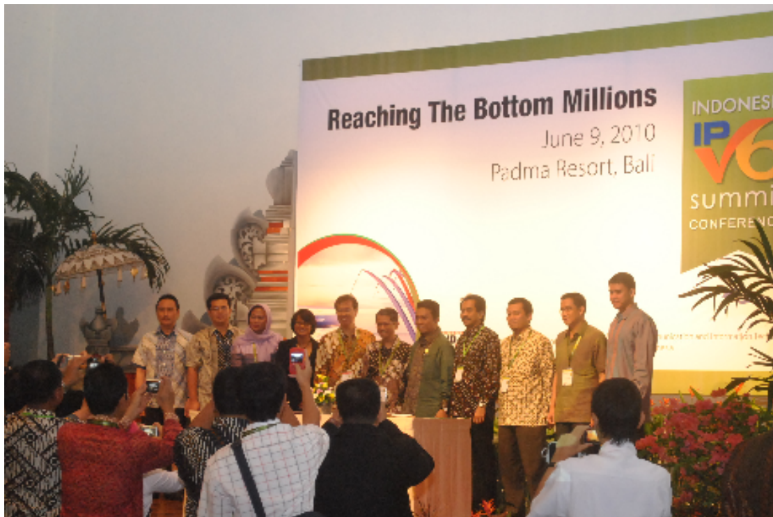
印尼資訊部長 Tifatul Sembiring 親自主持開幕和全國通訊業者宣誓導入 IPv6

本次印尼 IPv6 高峰會議由印尼資訊部長(Minister of Communication and Information Technology) Tifatul Sembiring 親自主持開幕和全國通訊業者宣誓導入 IPv6。可見由於 IPv4 位址枯竭的時間逐漸逼近，原本資訊建設相對落後的印尼在這次會議的宣誓活動相當盛大且慎重，大會開幕和宣誓場面有滿滿的記者和參與來賓。這次大會的主軸為 “Reaching the bottom millions”，意思就是要縮短數位落差，這相當符合印尼現況，他們有太多小島，資訊建設普及不易。我參與活動現場感受到印尼政府已經下極大決心全面導入 IPv6。