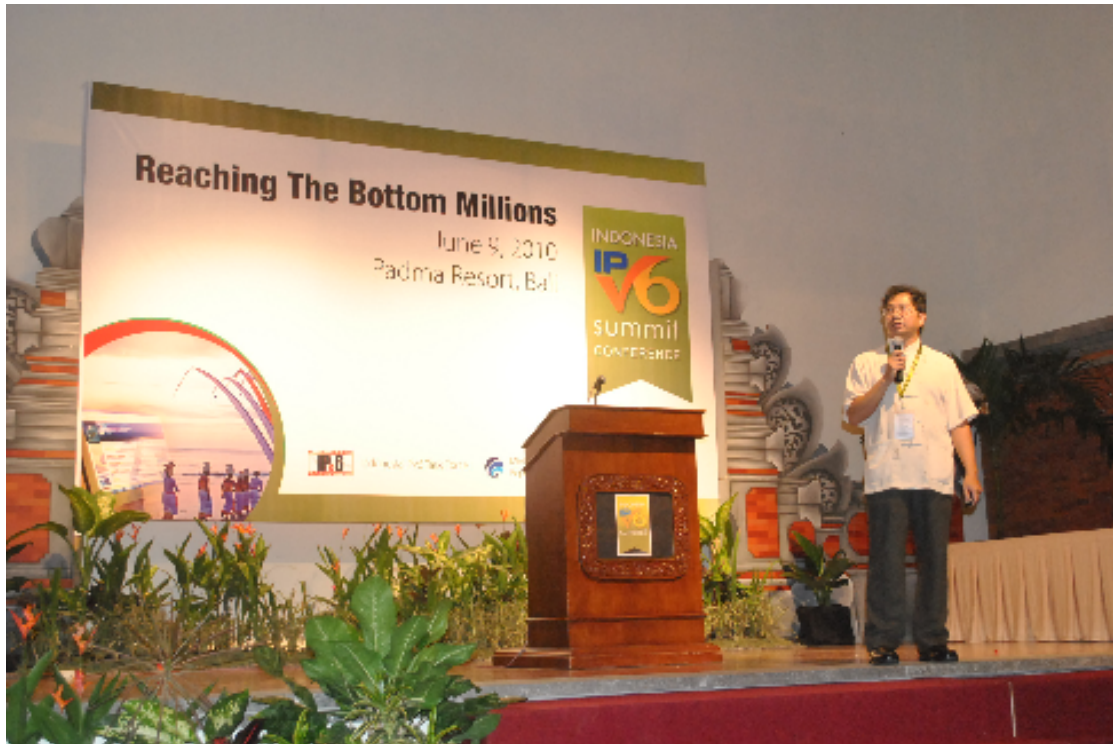
本人於 6/9 在大會演講 “IPv6 Services and Applications in Taiwan”